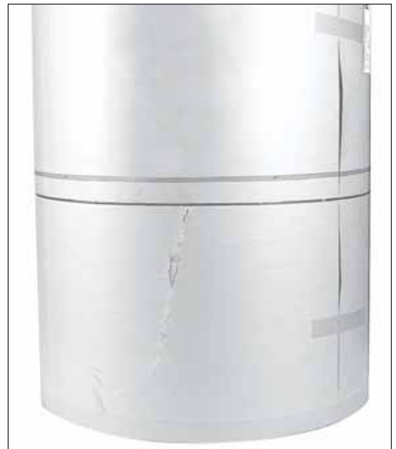
Photo shows damage caused when arm drops due to slack in the chains. This situation can be eliminated with Cascade's Drop Stop Valve. The savings in one day can pay for the added cost.

Damage is caused by the tendency for a lift truck driver to hold the lowering control valve open after the load has been safely deposited. This over-riding causes slack in the lift chain and subsequent dropping of the carriage which causes damage to the load from the forks or attachment arms.